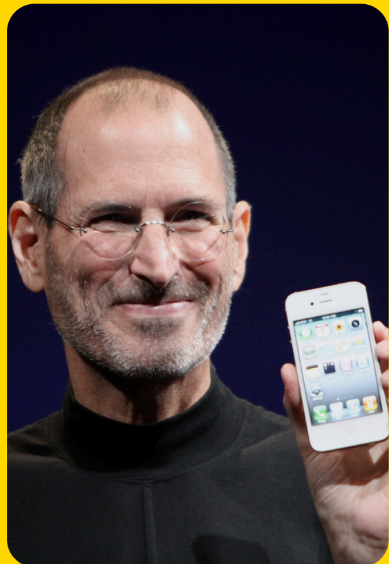
CO-FOUNDER OF APPLE INC

He built his company Apple which prioritized user-friendly design, seamless integration, and cutting-edge innovation, revolutionizing the personal computer, music, and smartphone industries. His products—such as the Macintosh, iPod, iPhone, and iPad and transformed technology to be more admired by millions.